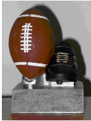
FTBALL & SHOE $9.90