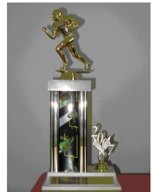
FTBL BOX $13.50