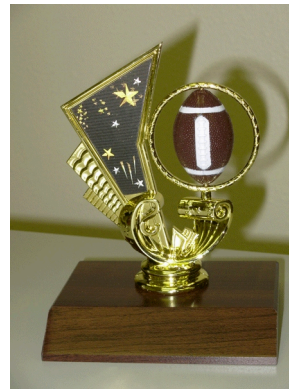
FTBL SPINNER $7.00