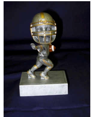
FTBL BOBBLE $9.90