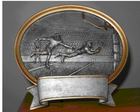
FOOTBALL PLATE $11.00